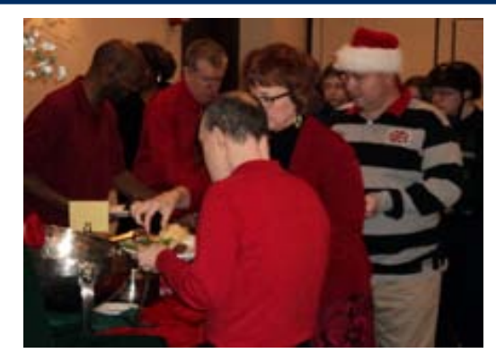
Guests enjoying a delicious Holiday Buffet at HMEA's 2016 Annual Shared Living Holiday Party

you to the LaSallette Shrine for its generous donation which helped to make this holiday party another success. And, we would also like to mention how much we appreciate the staff and crew of Lake Pearl Wrentham for always making this event so very special for everyone at HMEA.